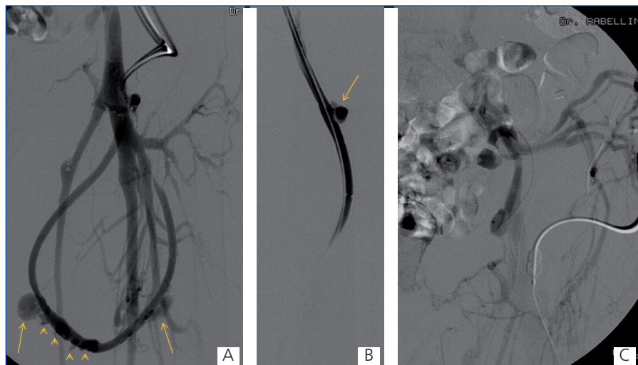
Figure 1. Fistulographies.

A and B: left femoral loop fistulography showing 3 pseudoaneurysms in the therapeutic range (arrows) and small pseudoaneurysms in the puncture site of the prosthesis (arrow heads), associated with venous hypertension in the limb. C: collateral circulation through the hypogastric venous branches due to stenosis of the external iliac vein and occlusion of the primitive iliac vein.